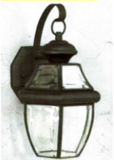
Medium 8"W x 14"H x 8"E (1-100 Watt Bulb)