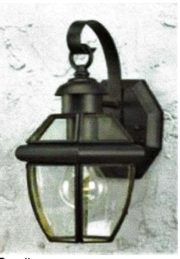
Small 7"W x 12"H x 6.75"E (1-100 Watt Bulb)