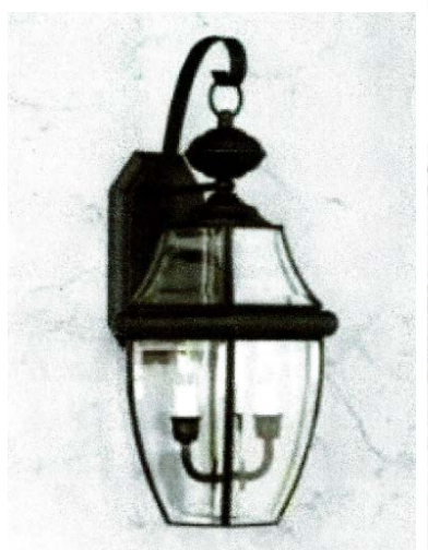
Large 10"W x 21"H x 10"E (2 60-Watt Cand. Bulbs)